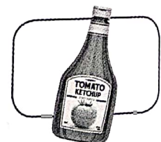
5. (the salsa / the ketchup)