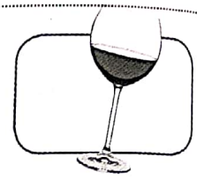
3. (a champagne glass / a wine glass)