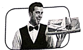
6. (Tom's cheeseboard / Kevin's cheeseboard)