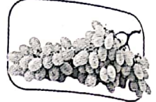
1. (nuts / grapes)