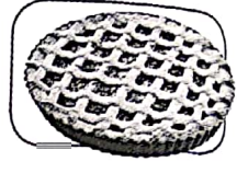
2. (the cake / the tart)