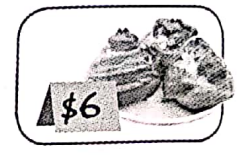
4. (the cheesecake / the profiteroles)